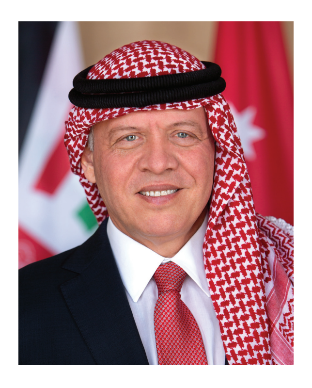
صاحب الجلالة الهاشمية الملك عبدالله الثاني ابن الحسين المعظم حفظه الله